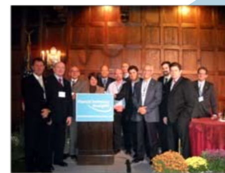
Financial Technology Insight

Europe Eisenmarkt 4 50667 - Cologne – Germany Phone +49 221 257 0786 europe@eccox.com www.eccox.com