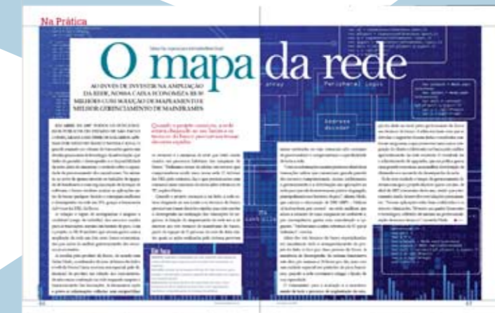
Information Week Ed 209

Headquarter Al. Rio Negro, 433 - 4º andar - Ed.1 06454-904 - São Paulo - Brazil Phone +55 11 4133-1969 brazil@eccox.com www.eccox.com.br