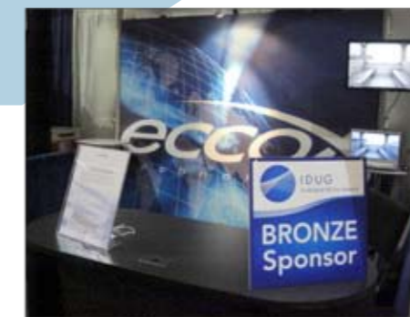
Patrocínio IDUG 2010 - Flórida