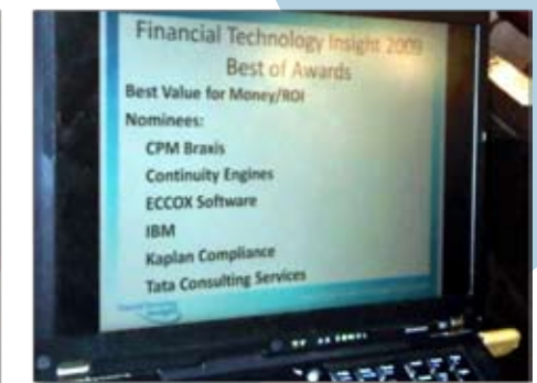
Financial Technology Insight: solução com excelente ROI